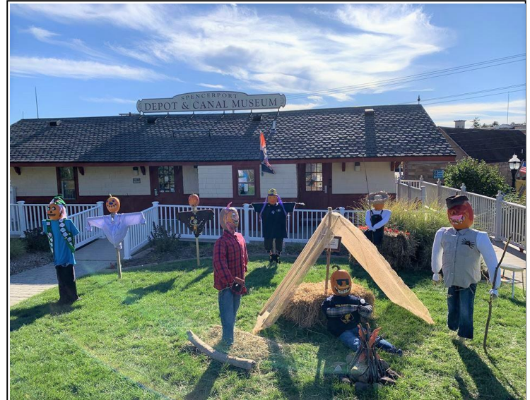
The Pumpkin People Community (outside the Museum)

The Rochester Museum and Science Center built a 1/64 interactive scale model of the Union Street Lift Bridge which was delivered in late 2018. This has been a big attraction in 2019. More improvements are planned for this display in the near future.